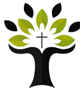
Lutheran Planned Generosity of South Dakota

As a partner ministry of the South Dakota Synod, ELCA, Lutheran Planned Generosity of South Dakota (LPGSD) was created to join you on your journey to discover ways to create your personal legacy plan —one that expresses your faith in Christ with gratitude and generosity. LPGSD also walks alongside congregations hoping to create or revitalize their own legacy through an endowment fund, offering members the opportunity to share in the ministry and outreach of their Christian family. Walking and working together, we can create greater impact because of intentional plans and shared visions.